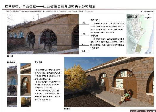
A case of restoration of ancient village houstown