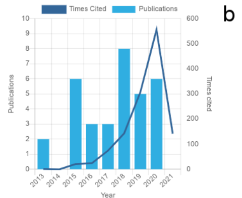
Figure 1: h-index graphs from Scopus (a) and WoS (b) as of April 23, 2021.